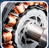
THREE-PHASE MOTOR DRIVES