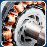
FULL- AND HALF-BRIDGE MOTOR DRIVES